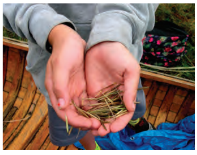
Primitive Skills-Wild Rice Foraging